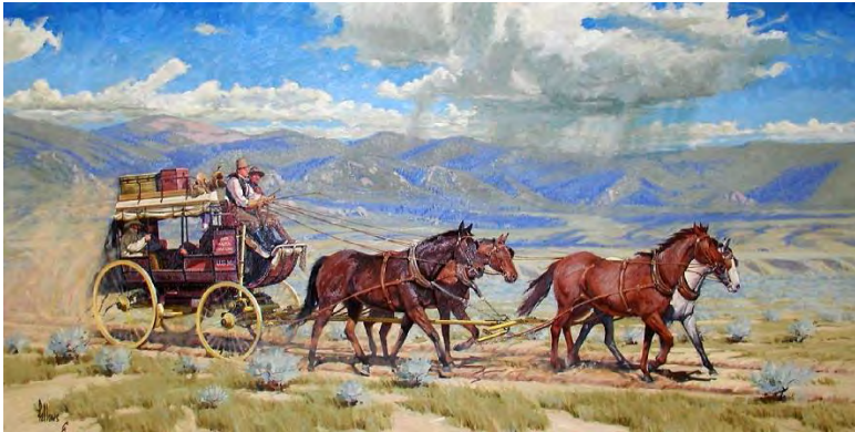
Joe Ferrera, Overland Stage Line, 2002, oil on canvas