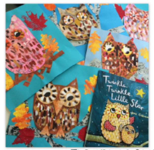
Painted Paper Art