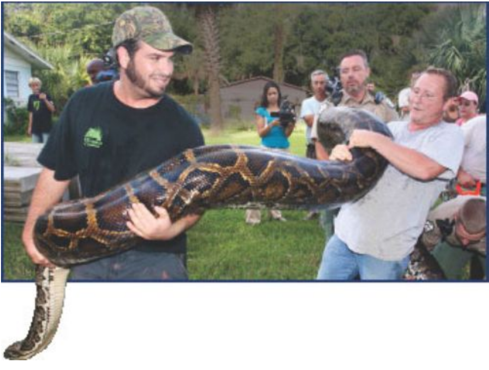
People in Florida move an 18-foot-long python to a safer home.

People who own pet snakes can help too, Rodda says. If you have a snake that gets too big for your home, take it to a zoo. "We don't want to create a problem by [setting free] an animal we no longer want to take care of," says Rodda.