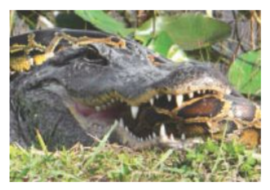
National Park Service